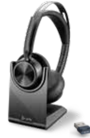
VOYAGER FOCUS 2 UC WITH CHARGE STAND