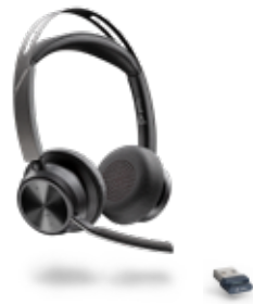
VOYAGER FOCUS 2 UC