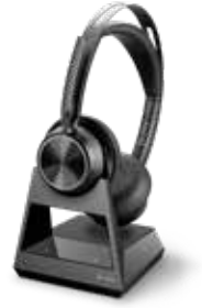
VOYAGER FOCUS 2 OFFICE